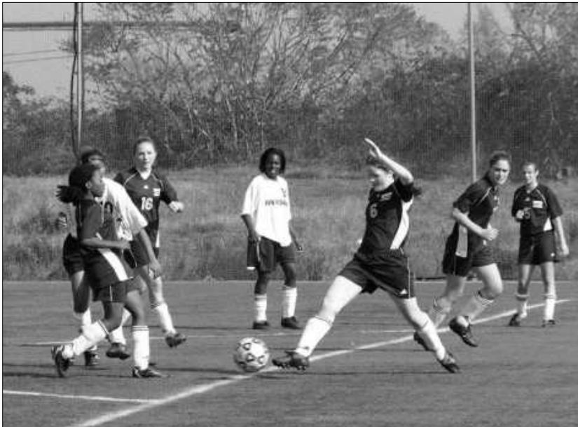
Our winning Varsity Girls Soccer team in action.