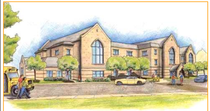
An artist's rendering of WCA's future home.