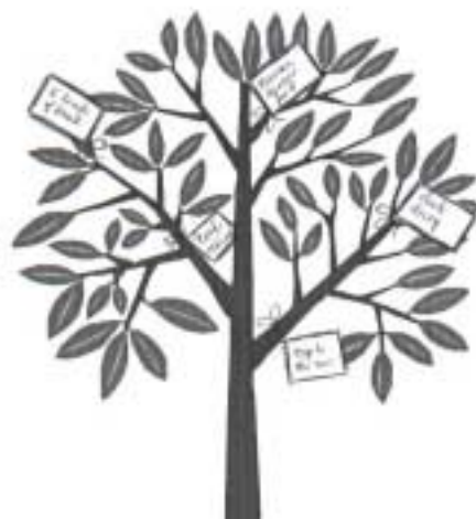
The Promise Tree

Over two decades ago, in the early years of this worthy tradition, the "promises" were attached to the branches of a small tree, and the auctioneer called them out one by one as he retrieved them from the branches. The auction was part of a festive dinner, so the event was called the "Promise Tree Dinner." As the school grew, the number of participants and the number of promises grew, too, therefore the format gradually changed, but the giving and festive spirit of the evening remains.